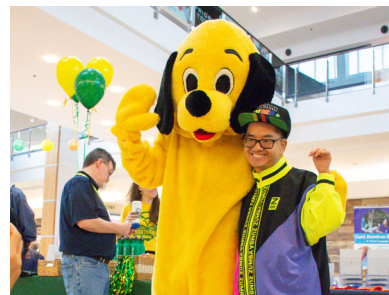
Celebrate Communication in Sept.