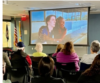
Reel Abilities Film Fest in March