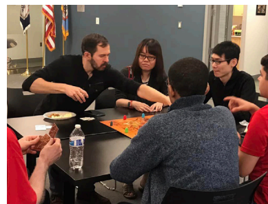
Game Day in April