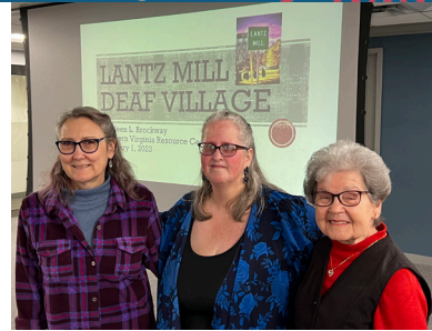
Lantz Mills Display & Program in February

Scan to see letter online and additional photos