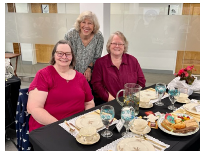
Tea Party in May